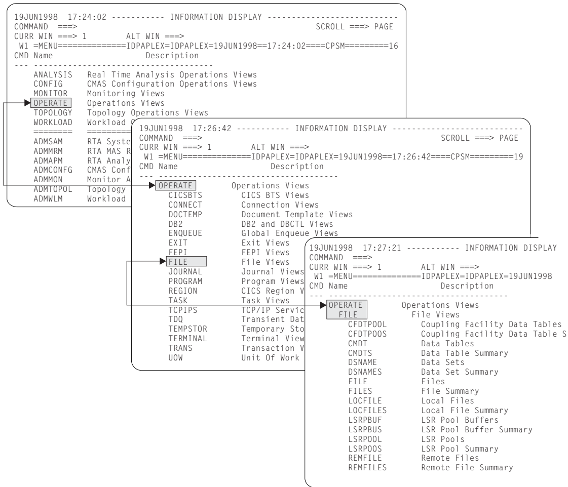
Figure 18. MENU, OPERATE, and FILE menus